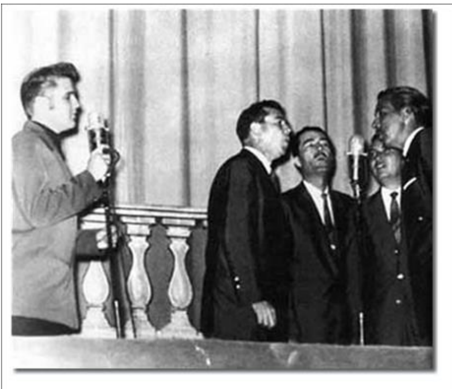
Elvis performs with The Statesman Quartet at Ellis Auditorium | July 27, 1956

"I'm not trying to hog it with a copyright," he laughed. "I'm not going to the patent office."